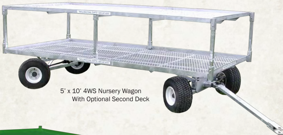
5' x 10' 4WS Nursery Wagon With Optional Second Deck