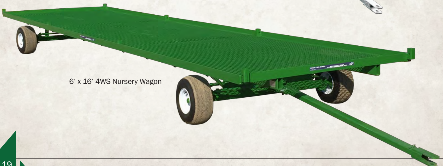
6' x 16' 4WS Nursery Wagon