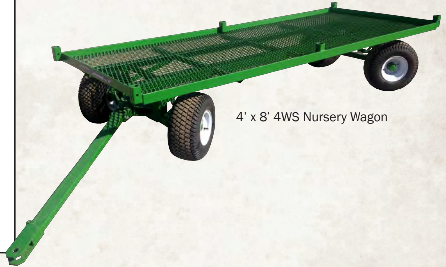
4' x 8' 4WS Nursery Wagon